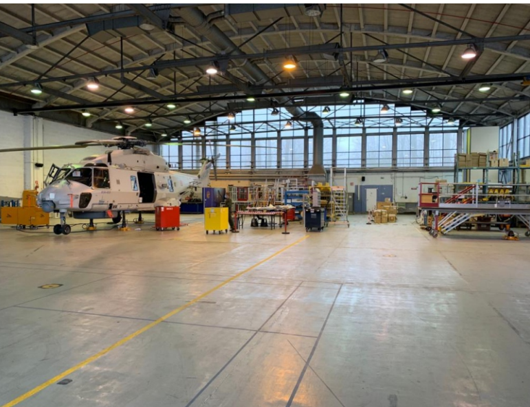
Voor: 400W HQL