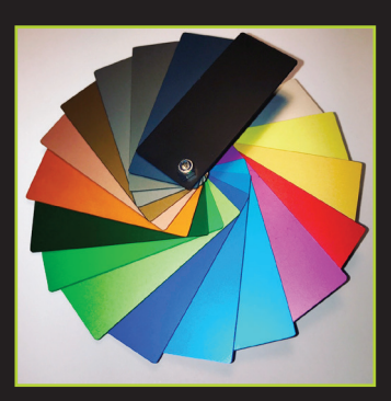
Available End Cap colours