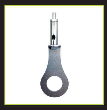
Tear Drop Suspension Kit