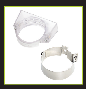
Plastic & Stainless Steel Clamps