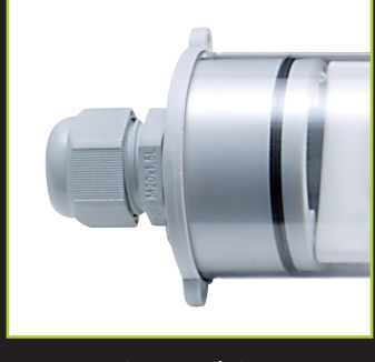
Grey End Cap

Emergency available from size 4 upwards, HE only. Through wired and plug & go add 30mm to the length.