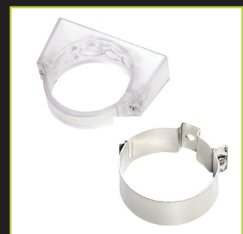
Plastic & Stainless Steel Clamps