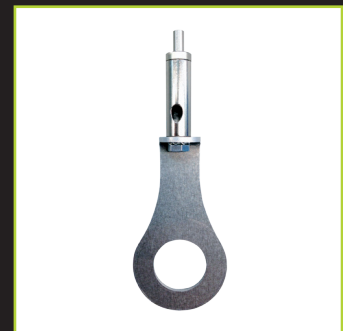
Tear Drop Suspension Kit