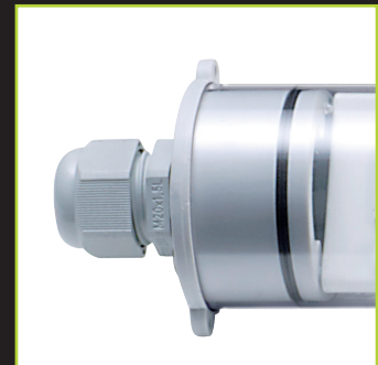
Grey End Cap