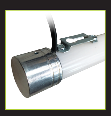
Discreet Rear Mount and Side Entry Cable

Total fitting wattage must not exceed driver wattage. Max cable length from driver to light is 10m.