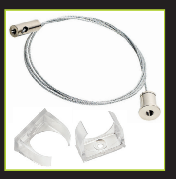
Suspension Kit & Polycarbonate Clips