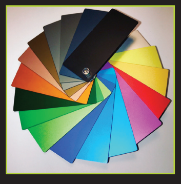
Available End Cap colours