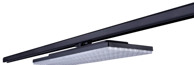
POWER PLATE T

LiteTime International reserves the right to modify or change technical, construction or LED specifications due to continuous improvements of our products and lightsources. The light source in this product can be replaced with an equivalent module made by Philips, Osram or Tridonic.